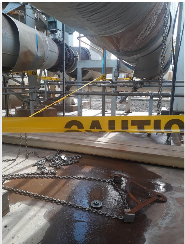
Picture above indicates the distance where the chain and retainer fell from height of approx. 5m.